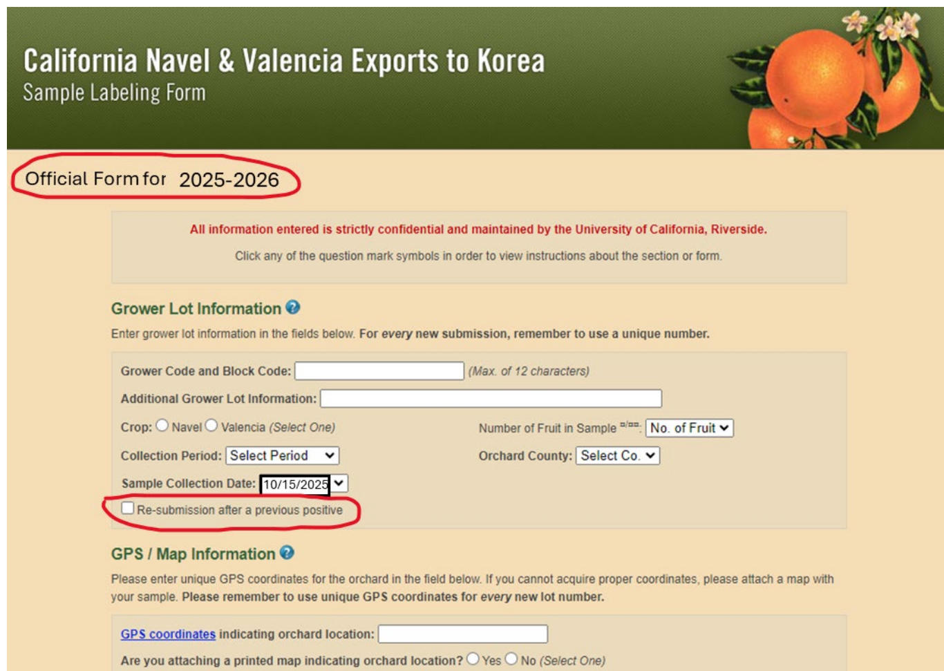
Suppl. Fig. 2. Portion of the electronic sample submission page for the NAVEK program for the 2025-2026 season. A new check-box (second red circle) has been added for the revised program (see text for details).