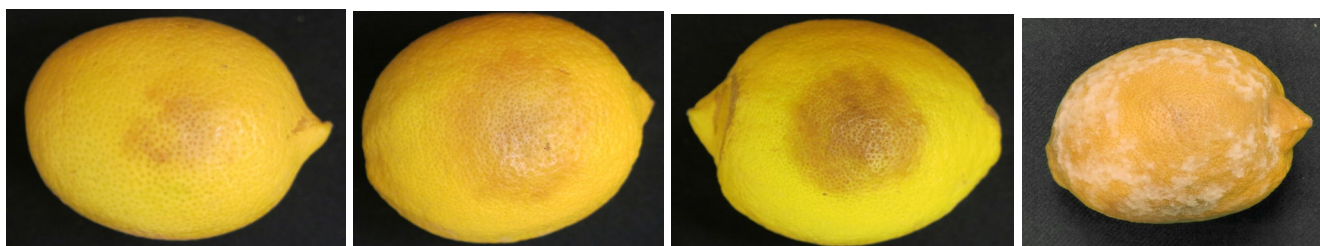
Fig. 4. Brown rot of lemon fruit caused by Phytophthora species. Early symptoms are shown in the upper images. Late symptoms are shown for brown, leathery decay with a distinct pungent odor (middle, right) and brown rot decayed fruit at high humidity with white mycelium on the fruit surface (far right).