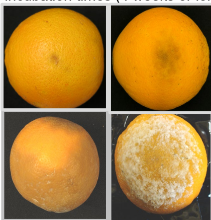
Fig. 3. Brown rot of orange fruit caused by Phytophthora species. Early symptoms are shown in the upper images. Late symptoms are shown for brown, leathery decay with a distinct pungent odor (bottom, left) and brown rot decayed fruit at high humidity with white mycelium on the fruit surface (bottom, right).

*- The US-China agreement requires incubation of Tulare Co. fruit, however, this is not a reliable method for detecting brown rot caused by P. syringae because incubation times at the 5C (41F) temperature may exceed 1 month before symptoms develop.