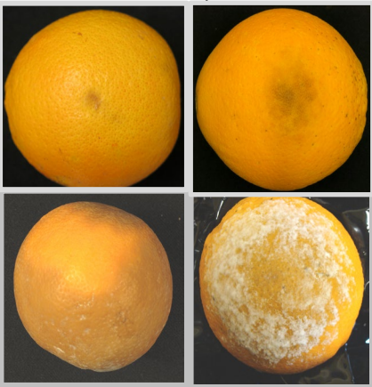
Fig. 3. Brown rot of orange fruit caused by Phytophthora species. Early symptoms are shown in the upper images. Late symptoms are shown for brown, leathery decay with a distinct pungent odor (bottom, left) and brown rot decayed fruit at high humidity with white mycelium on the fruit surface (bottom, right).

*- The US-China agreement requires incubation of Tulare Co. fruit, however, this is not a reliable method for detecting brown rot caused by P. syringae because incubation times at the 5C (41F) temperature may exceed 1 month before symptoms develop.