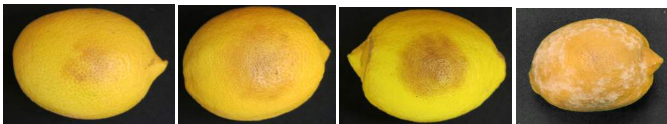
Fig. 4. Brown rot of lemon fruit caused by Phytophthora species. Early symptoms are shown in the upper images. Late symptoms are shown for brown, leathery decay with a distinct pungent odor (middle, right) and brown rot decayed fruit at high humidity with white mycelium on the fruit surface (far right).