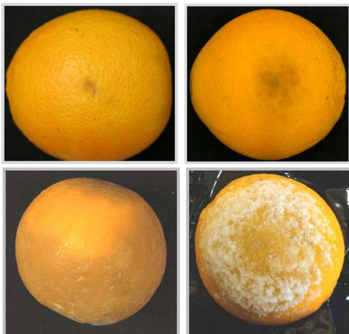
Fig. 3. Brown rot of orange fruit caused by Phytophthora species. Early symptoms are shown in the upper images. Late symptoms are shown for brown, leathery decay with a distinct pungent odor (bottom, left) and brown rot decayed fruit at high humidity with white mycelium on the fruit surface (bottom, right).